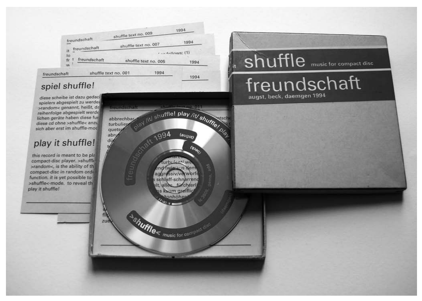
Fig. 3. Freundschaft, Shuffle. Music for Compact Disc, 1993. The packaging of Shuffle reflects the structure of the music: Just as the tracks may be played in any order, the 10 double-sided leafs of printed text can be freely arranged.

[R•] iso |chall not only makes the listener aware of the implications of the CD as an object, it also introduces the CD player as an instrument, capable of mechanically producing sounds.