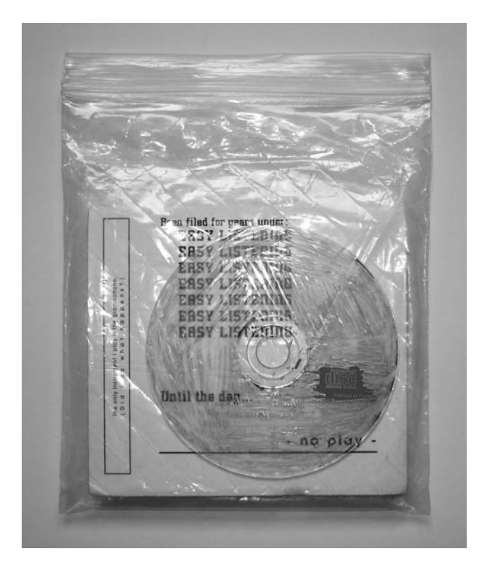
Fig. 1. Olivier Heinry, no play, 1996. As with the LP record before it, visual artists discovered the CD as a sculptural object. Thus, it was not to function in its intended use of audio storage and reproduction. The presentation of Olivier Heinry's no play refers to the way CDs were displayed in record stores.

cover made of sandpaper [15]. The record will inevitably get scratched, depending on its use. This treatment turns the mechanically reproduced object into a unique item, an inversion, that is only set up by the artist but carried out by the perceiver.